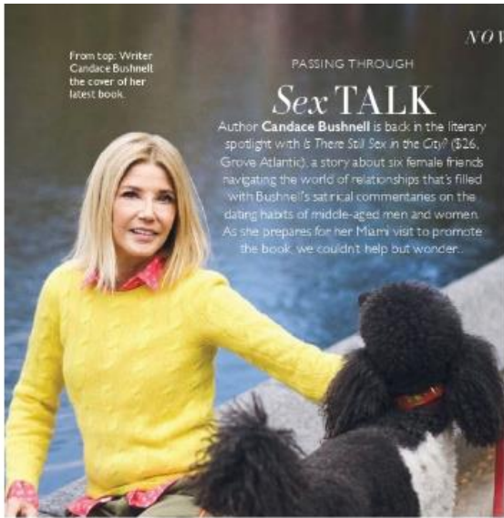
From top: Writer Candace Bushnell the cover of her latest book.